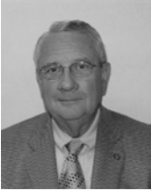
Mayor Glenn Stewart