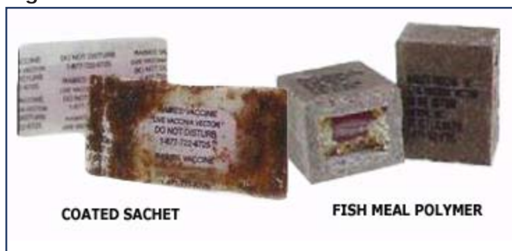
Figure 3. Oral Rabies Vaccine Baits

Visit http://www.odh.ohio.gov/odhPrograms/dis/zoonoses/rabies/rab1.aspx for more information about rabies in Ohio.