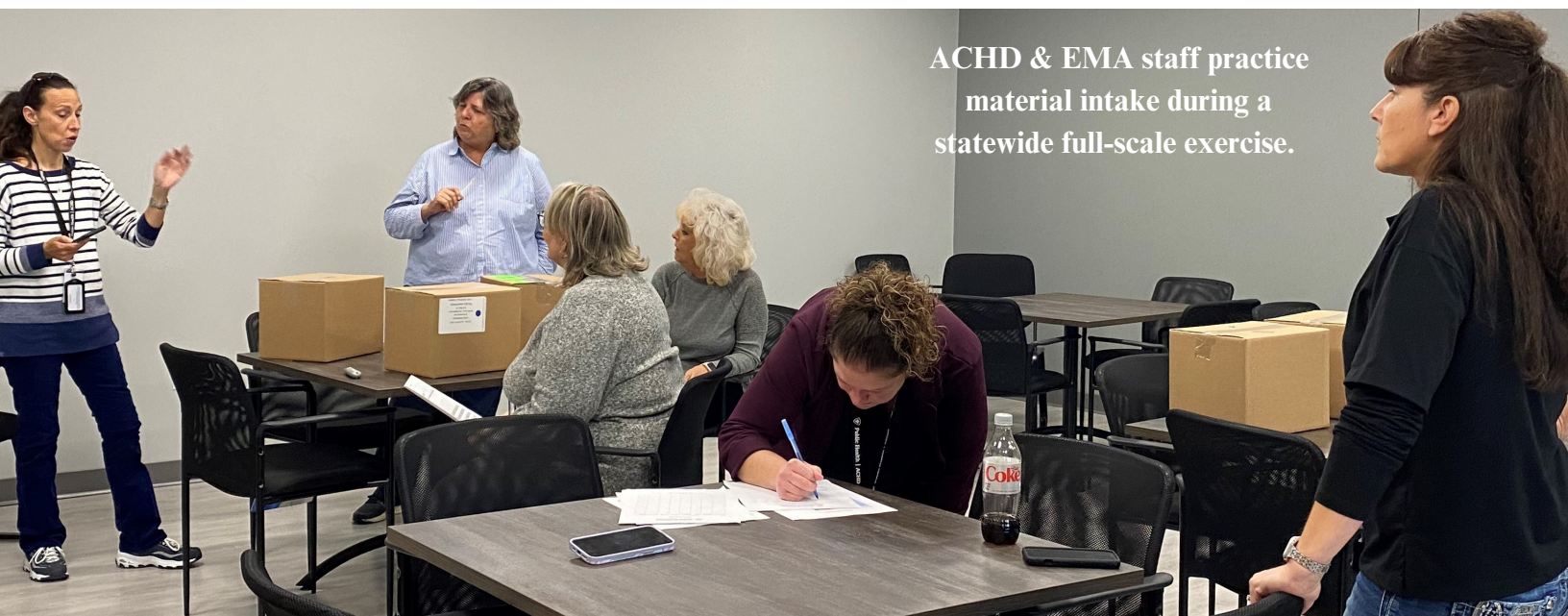
ACHD & EMA staff practice material intake during a statewide full-scale exercise.

Radiological incidents are also considered a hazard in Ohio, so we participated in a regional radiological exercise and a statewide radiation exercise in early 2023. Through these exercises, we were able to identify radiological hazards and risks in our county; our capabilities and limitations; and our role in a radiological incident. We were also able to test the following processes: notification and communication; triage and surge management; and our county’s ability to receive, assess, decontaminate, and treat patients with radiation exposure. Since our local partners also participate in these exercises, we work on any improvements or plan modifications together.