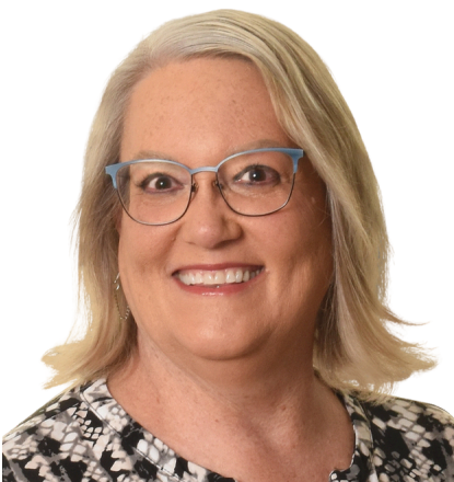
BS, MDiv, MA Health Commissioner